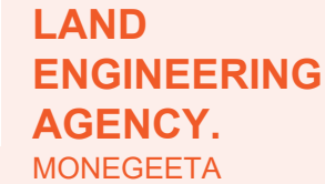
LAND ENGINEERING AGENCY. MONEGEETA