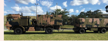
LAND 121 3B & 5B